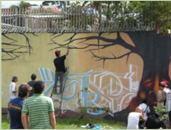
Many young people gathered on a weekend recently to paint the walls around Parque Copa near our house. It was amazing—mostly spray painted.

We just have too many flash cards scattered throughout our house to try and measure their height anymore!