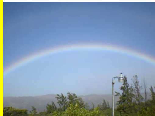
A beautiful rainbow in Monteverde Costa Rica. We could see where it touched the ground on both ends. We even were able to look down on a rainbow in a valley.