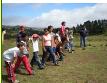
Lining up to play red light-green light.